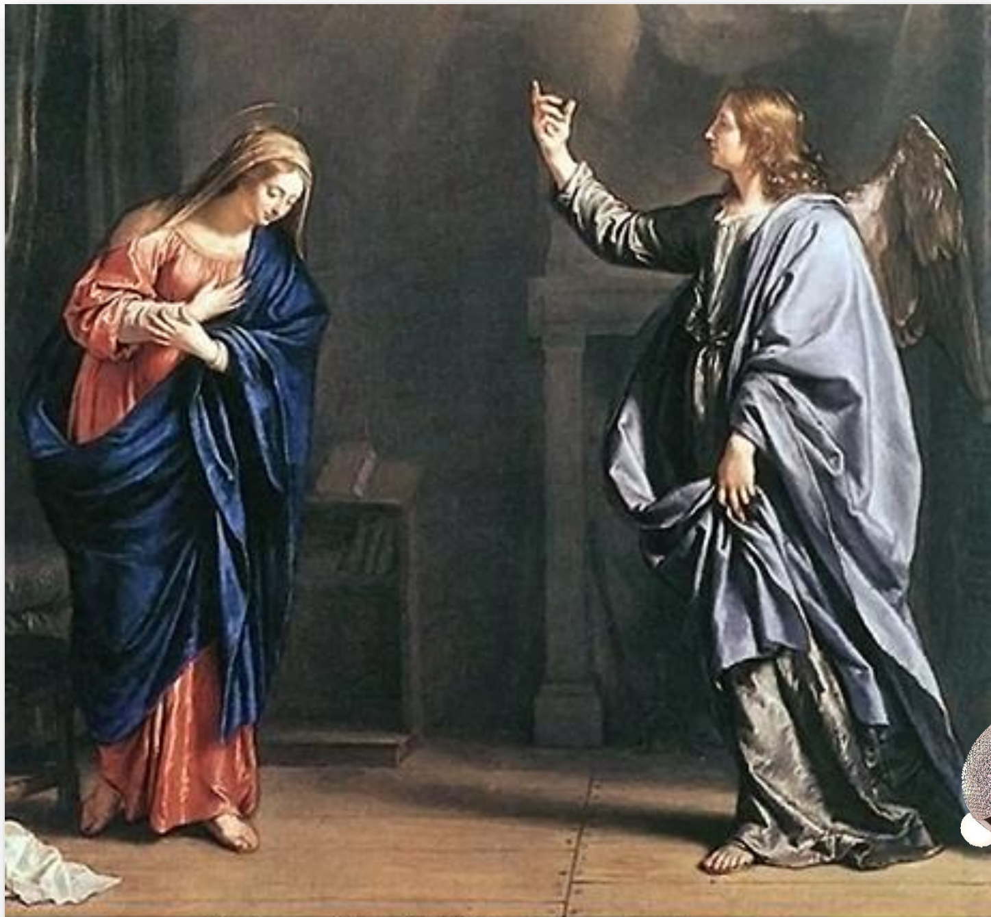
The Annunciation (detail) by Philippe de Champaigne