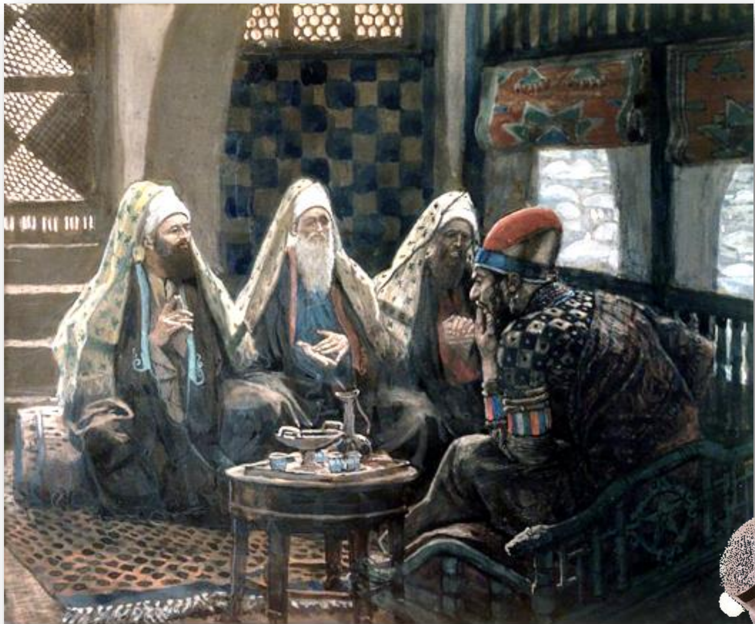
The Magi in the House of Herod by James Tissot